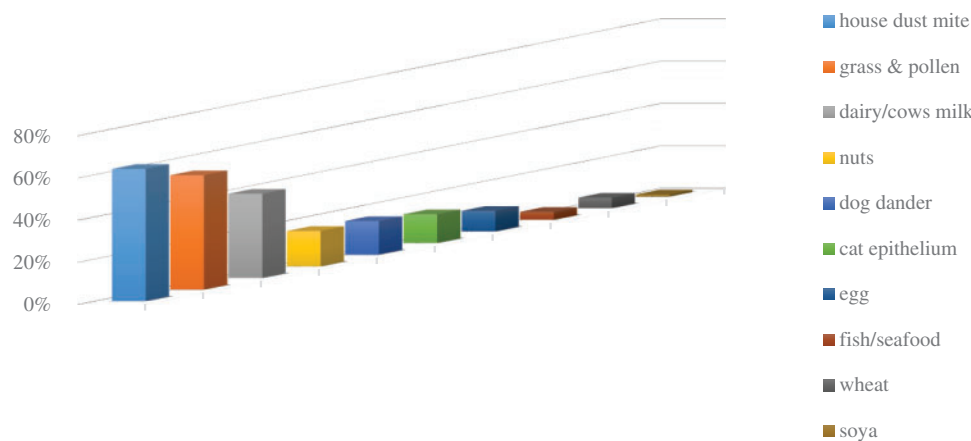
Fig. 2. This figure highlights the individual-specific IgE levels among patients who tested positive for RAST testing in 133 children with eczema [6].

atopic dermatitis. Specific IgE antibodies can be measured using radioallergosorbent testing, which has been deemed valuable for the investigation and management of atopic dermatitis [8]. In this trial, trigger foods were eliminated 2 weeks before the trial. In fifteen of the children, there was FA and 57% of patients with AD had a positive reaction to food. More recently, a population cohort study of over 4000 children highlighted infants with AD were six times more likely to have FA to cow milk, egg or peanut at age 12 months compared to those without AD [13]. We shall explore the relationship between FA and AD and comment on the advances made in this research, predominantly focusing on studies which involve children.